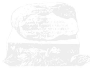
Aaron Burr Rock 1806