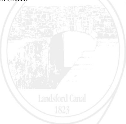
Landsford Canal 1823